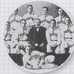
BOSTON PILGRIMS 1903