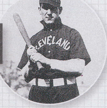
NAP LAJOIE CLEVELAND BRONCOS 1902

Like the Westward expansion that preceded it by a century, the migration of franchises has observed the logic of Manifest Destiny: Baseball is America's pastime, and where the land is open, the soil fertile and the sky wide, the game must take root. (In the only eastward relocation in the last 35 years, the Seattle Pilots, 64-98 during their lone season, in 1969, fled only to be reborn as the not-much-better Milwaukee Brewers.) We saw the California transplantation of the Dodgers, Giants and Athletics, and the creation of new clubs in Texas, in the Rocky Mountains